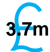
Scottish Spend to date