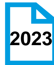
Offshore Scoping Submission