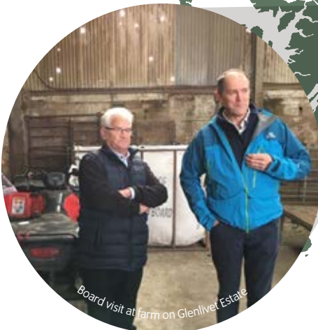
Board visit at farm on Glenlivet Estate