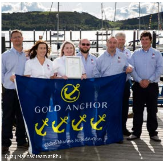
Quay Marinas' team at Rhu