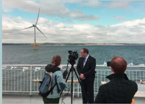
Paul Wheelhouse MSP, Energy Minister, at the EOWDC inauguration

Crown Estate Scotland worked closely with developers and partners on these two major projects in Scottish waters to create opportunities for the type of developments that will help meet Scottish Government's proposed target of half of Scotland's heat, transport and electricity energy needs being met by renewables by 2030.